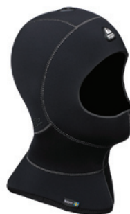
Includes a H1 5/7mm hood with double vent H.A.V.S technology